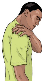
Joint and Muscle pain